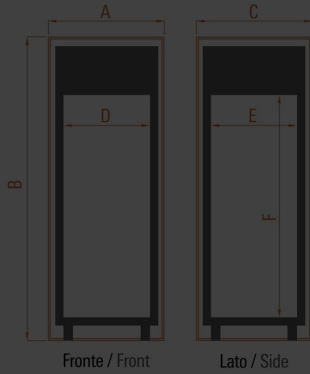
Fronte / Front