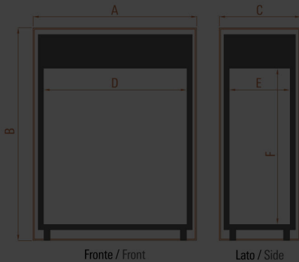
Fronte / Front